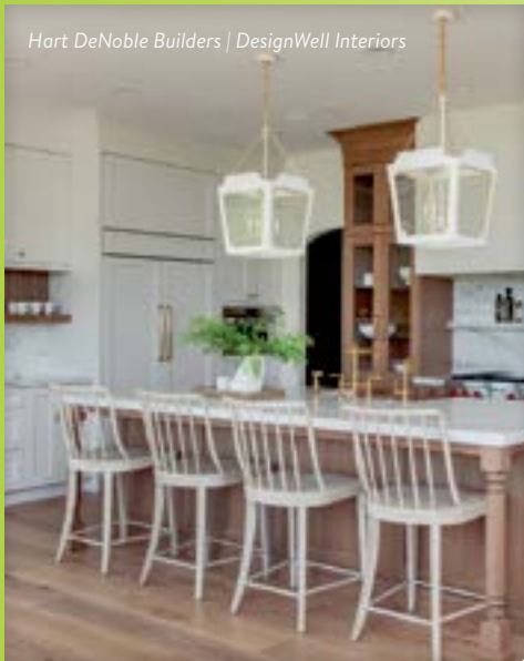
Hart DeNoble Builders | DesignWell Interiors

Component Division 1204 E. Lincoln St. Mt. Horeb, WI 53572 608.437.7183